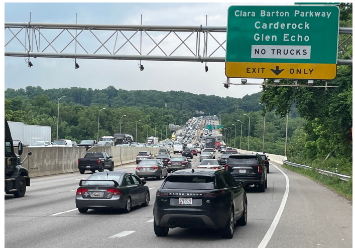
TRAFFIC ALONG THE INNER-LOOP OF THE CAPITAL BELTWAY AT THE AMERICAN LEGION BRIDGE.

MDOT issued the DEIS over 2 years ago, and issued a Final EIS in June 2022. They allowed 30 days to comment on the final 26,000 page document, the minimum required under the National