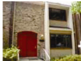
3726 Nimitz Rd, Silver Spring 3 BR, 3 FB, 1 HB $425,000