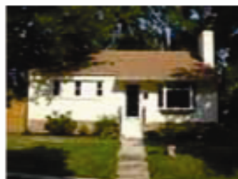
501 Royalton Rd, Silver Spring 3 BR, 2 FB $419,000

Check Out Just A Few of My Listings – More on www.helpmerhondarealestate.com !