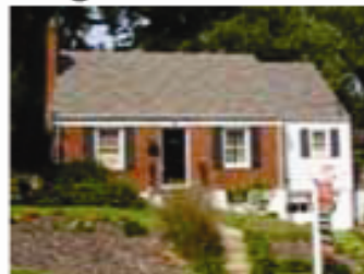
806 Buckingham Dr, Silver Spring 3 BR, 2 FB $419,500